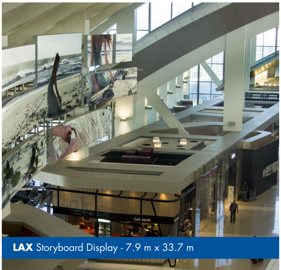
LAX Storyboard Display - 7.9 m x 33.7 m