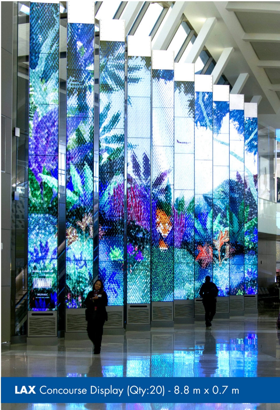
LAX Concourse Display (Qty:20) - 8.8 m x 0.7 m

arrive, depart and everything in between. Create an unforgettable experience by immersing travellers in an environment surrounded by eye-catching content. Pique their interests with third-party advertisements, adding to their journey while developing a revenue source.