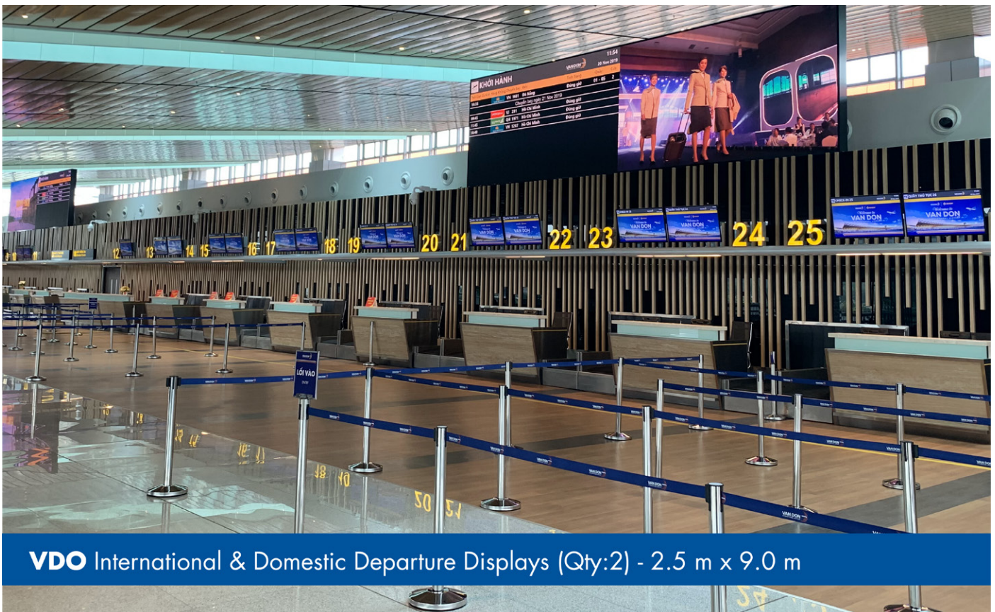
VDO International & Domestic Departure Displays (Qty:2) - 2.5 m x 9.0 m

Daktronics delivers a seamless passenger journey