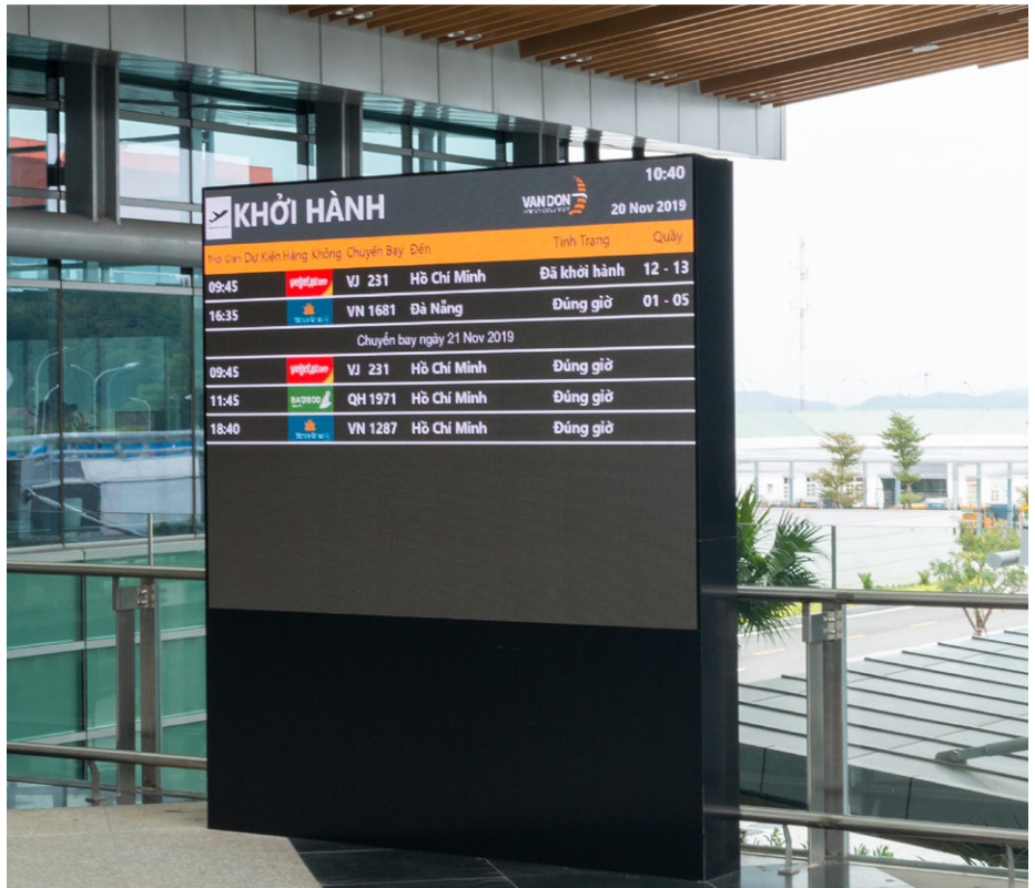
VDO International Departure Display - 1.5 m x 2.0 m

To see for yourself, visit us at DAKTRONICS.COM/AIRPORTS