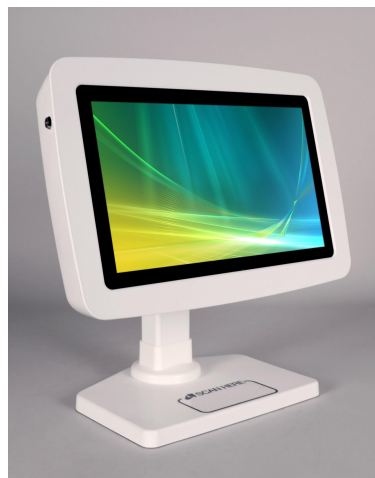
Integration Base Arrowhead