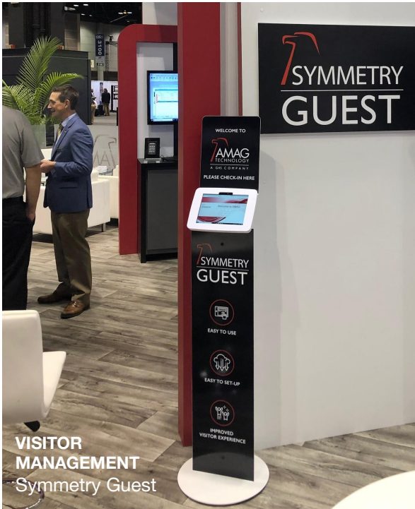
VISITOR MANAGEMENT Symmetry Guest

Find out more about our case studies showcasing our Halo kiosks