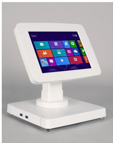
Integration Base Square