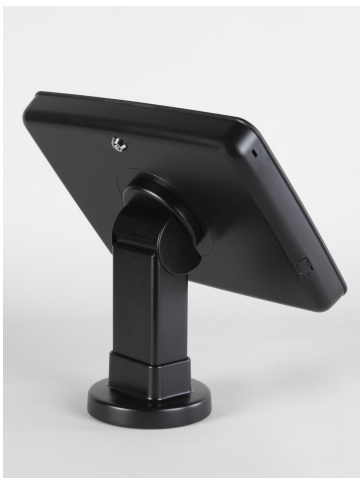
ISO Counter Stand