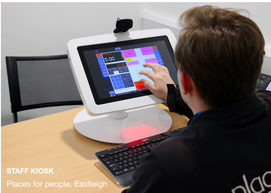
STAFF KIOSK Places for people, Eastleigh