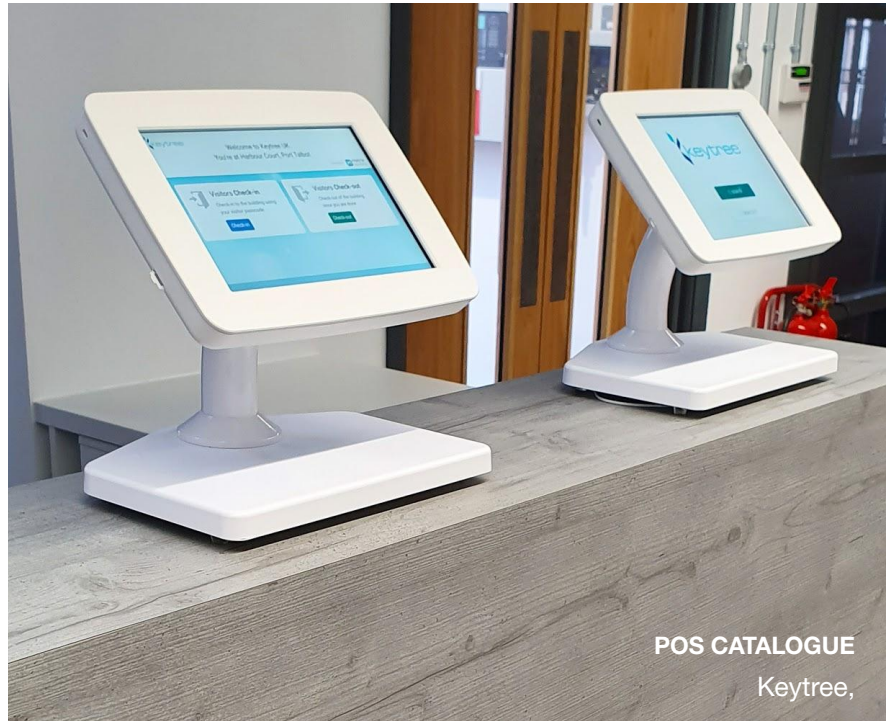
POS CATALOGUE Keytree,