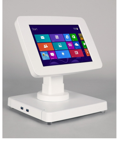
Integration Base Square