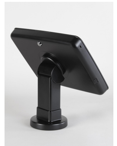
ISO Counter Stand