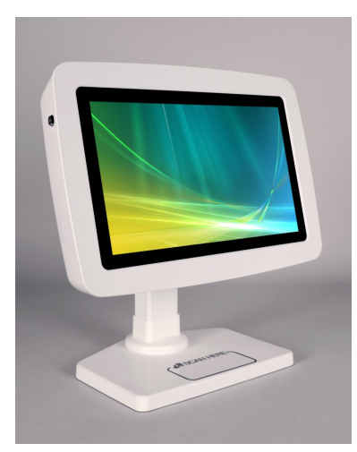
Integration Base Arrowhead