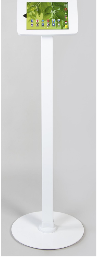
ISO Floor Stand