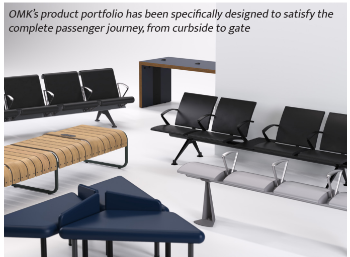
OMK's product portfolio has been specifically designed to satisfy the complete passenger journey, from curbside to gate

an existing one. Trax , our most modular beam seat and Flite , our high-density compact beam system, both provide solutions for long dwell time locations. Our products enhance passenger experience whilst remaining extremely durable, making them ideal for use in demanding built environments. Seville , our short-sit bi-directional bench is ideal for ancillary areas, and Link , a modular bench system with a unique geometric shape creates various configurations as short-sit solutions.