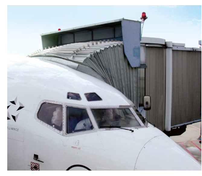
▲ Passenger boarding bridge docked to a Boeing 737

A central motor drives the HÜBNER folding canopies. Four different drive variants are available: a manual drive, a 24V DC drive (for mobile passenger steps), as well as 120V/50 Hz or 230V/50 Hz three-phase AC drives. The motors are designed to handle the extreme weather conditions encountered at airports around the world and are equipped with a freewheel safety mechanism in