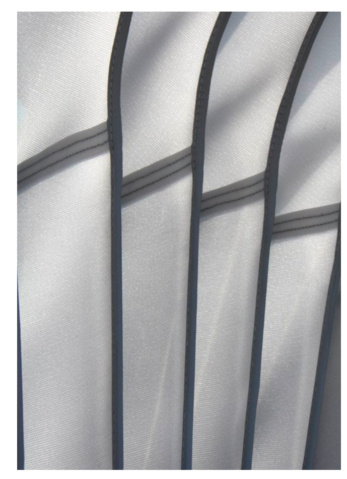
▲ Translucent folding bellows make the canopy airy and light