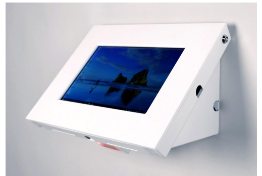
45 Deg Wall Mount