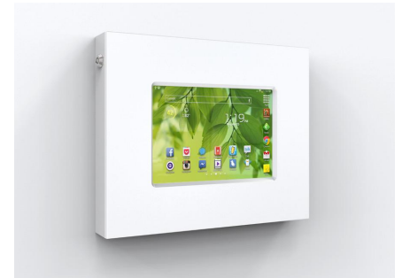
Slimline 8 Spec Sheet