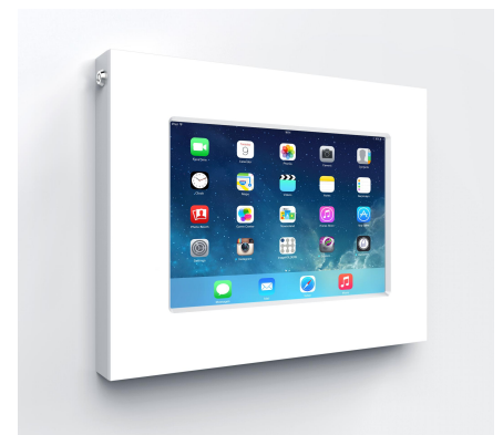
Slimline 12 Spec Sheet