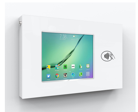
Slimline 10+ Spec Sheet