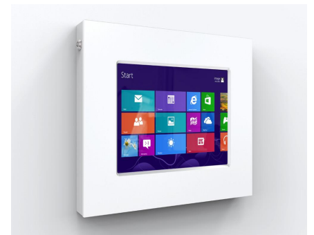
Slimline 10 Spec Sheet