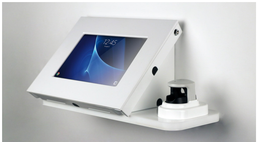
45 Deg with Device Shelf