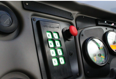
Complete mobility control.