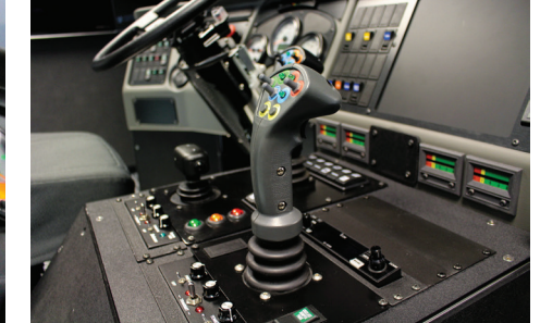
Total command over foam / Snozzle® operation.