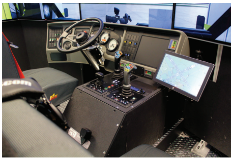
Cockpit styling identical to the Striker.