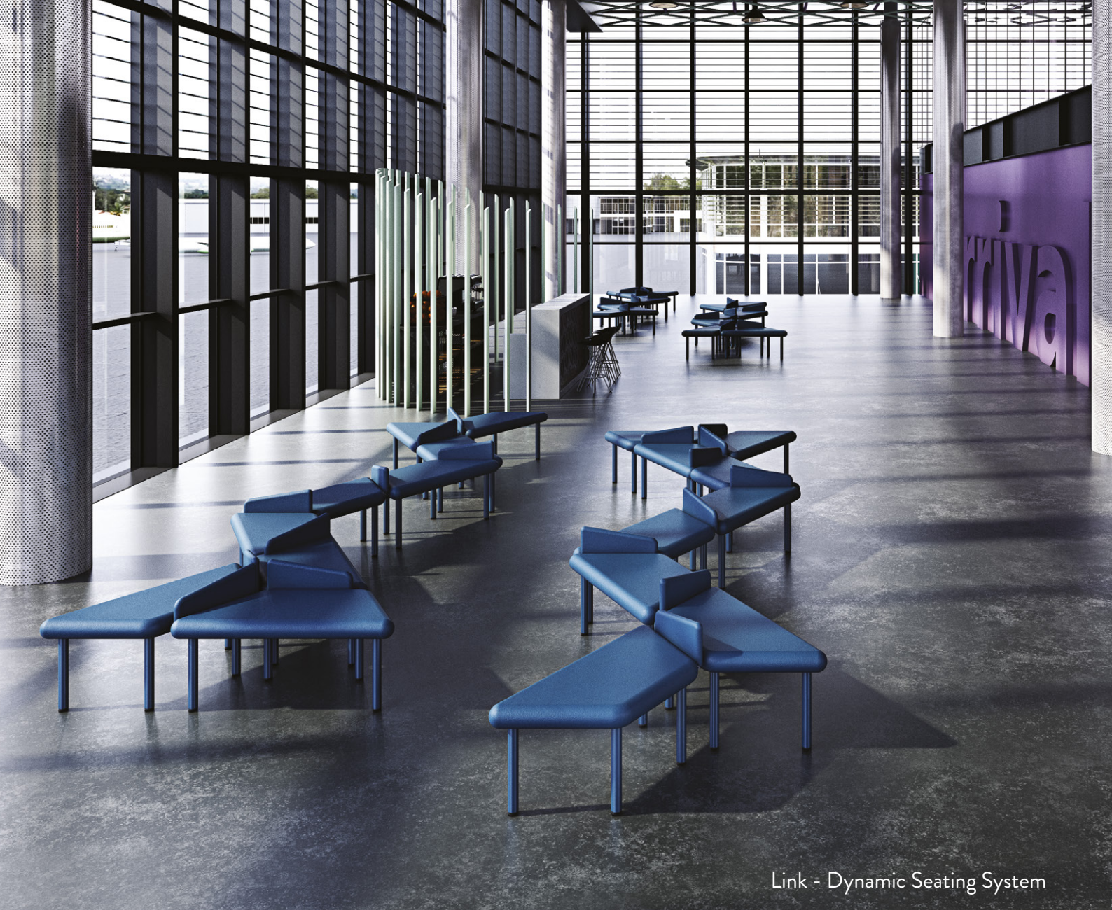
Link - Dynamic Seating System