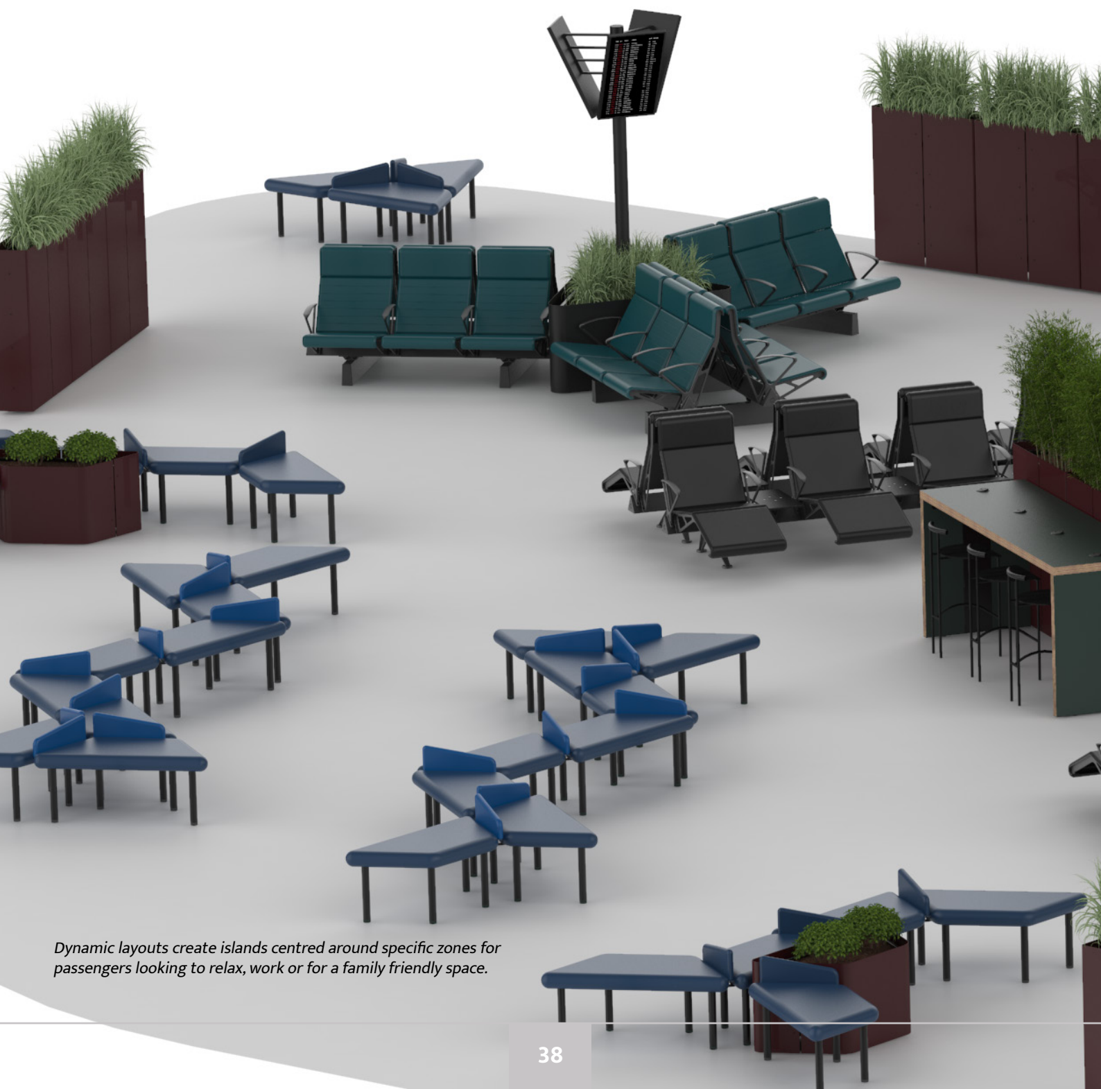
Dynamic layouts create islands centred around specific zones for passengers looking to relax, work or for a family friendly space.

OMK offers free worldwide consultation on spatial planning, passenger flow and behavioural analysis. In addition to product specification, OMK helps customers select the correct solution from its focused range of products. With its furniture installed in over