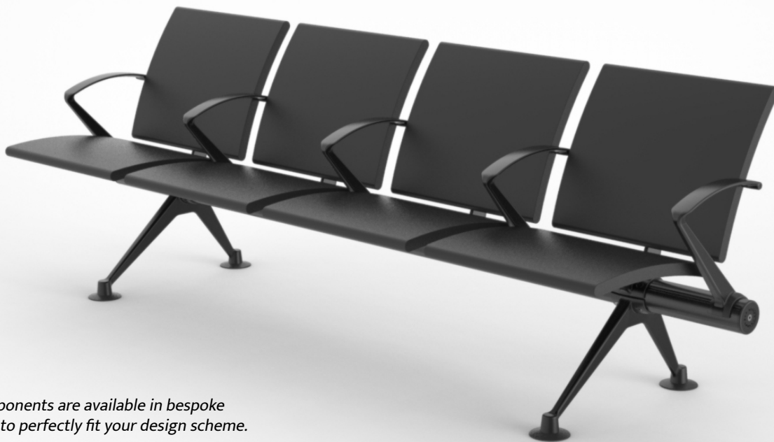
All components are available in bespoke colours to perfectly fit your design scheme.

at airports. The key to creating a more welcoming space is to focus on passenger flow, reducing congestion and in turn creating more useable spaces. OMK has been promoting the use of dynamic seating layouts for many years, encouraging its customers to reconsider linear seating in favour of articulated runs that match the built environment. This type of layout when combined with a range of products can create islands centred around specific zones for passengers looking to relax, work or for a family friendly space. Integrated technology can provide easy access to touchpoints such as intelligent charging points and information display screens which in turn decreases stress levels as passengers can relax whilst using the space for longer. To reduce movement in the centre of each zone, short-sit seating is placed on the perimeter of each island where the passenger flow is more active, reducing hot spots around long-sit areas. The positive benefits are not just limited to passengers. Dynamic layouts are proven to