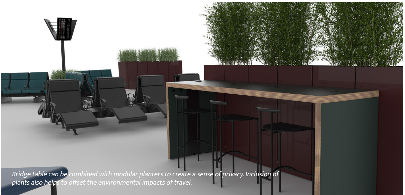
Bridge table can be combined with modular planters to create a sense of privacy. Inclusion of plants also helps to offset the environmental impacts of travel.